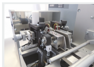
Sealing shoes with micrometer screw