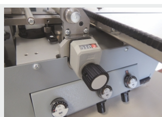
Adjustment for tape width with indicator